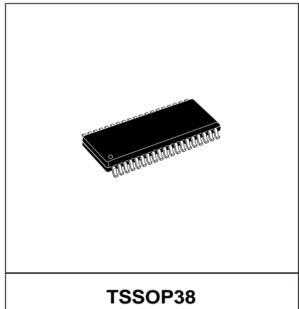
Thin Shrink Small Outline Package